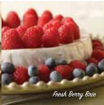
Fresh Berry Brie