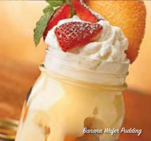
Banana Wafer Pudding