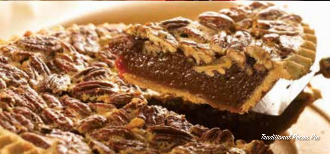
Traditional Pecan Pie