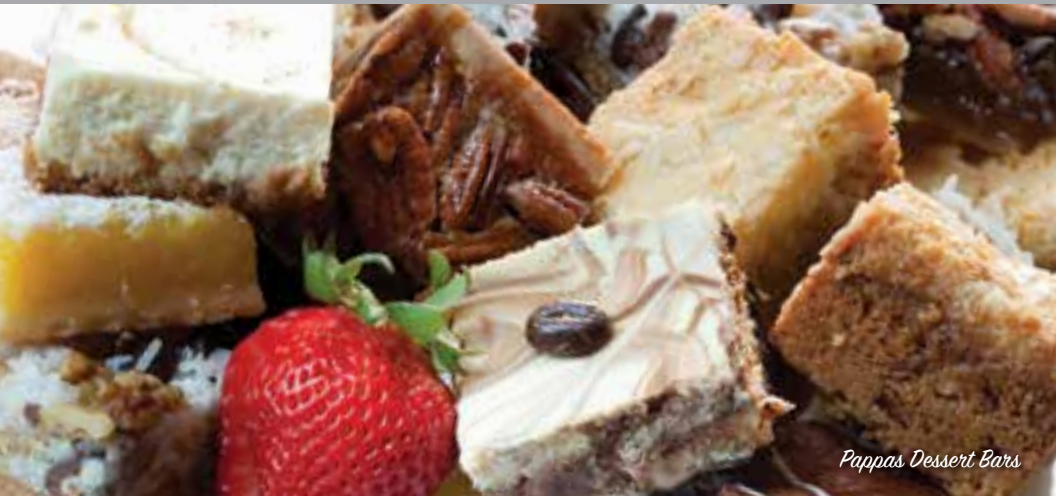
Pappas Dessert Bars