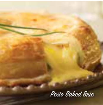
Pesto Baked Brie