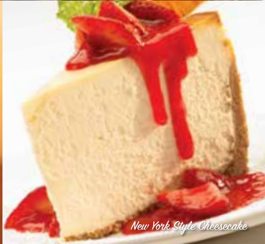
New York Style Cheesecake