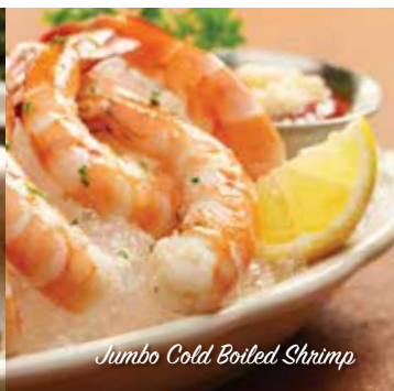
Jumbo Cold Bottled Shrimp