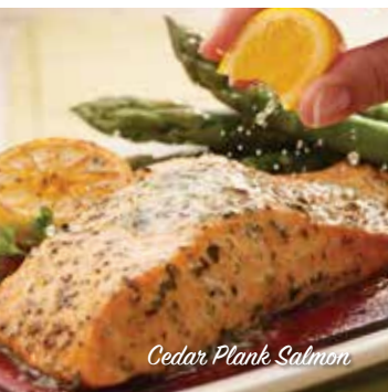
Cedar Plank Salmon

†Available exclusively where on-site grilling is possible.